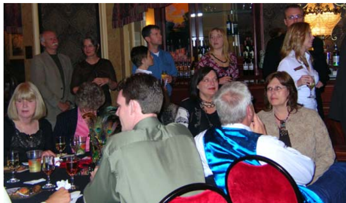
Carnivale, the Sculpt Siouxland Celebration Auction featured entertainment by Riversance. Here attendees enjoy the festivities prior to the auction.

During the 2005-2006 year, 13 sculptures from regional artists were selected for outdoor placement along Fourth Street between Virginia and Pearl streets.