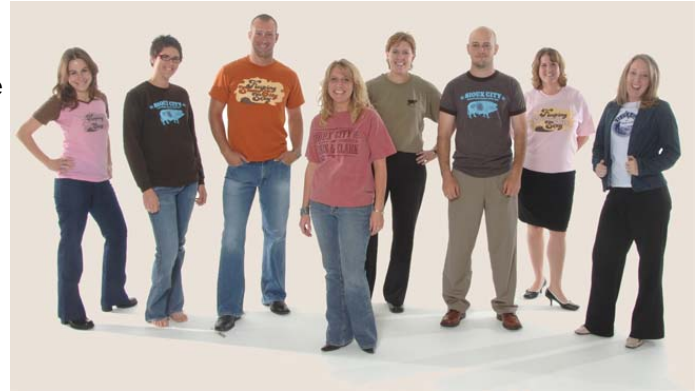
SCGO Members model the selection of styles and colors of T-shirts promoting Sioux City.

"Sioux City GO is a wonderful way to meet new people and promote our city at the same time. The motives and goals of this group are far more ambitious than most people realize."