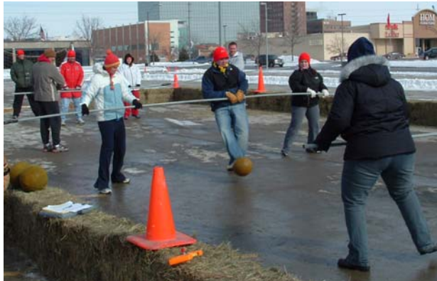
Above: Human Foosball was one of the highlights of Freeze Fest 2007.

In total, the event raised $2,500 to go towards the first ever SCGO Scholarship. A Sioux City high school senior will be awarded this scholarship in May of 2007.